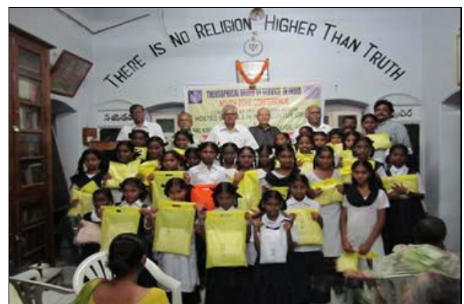
Thirty students were provided with school uniforms.