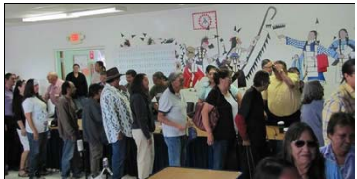
Rosebud Sioux Tribe