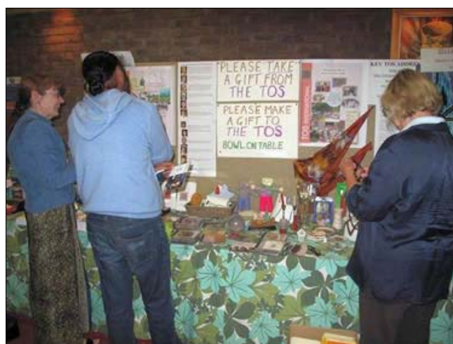
Prices are not affixed to the items on the sale table at the Summer School. Members help themselves to whatever they want and give whatever sum they can afford. A surprisingly effective sign says, "Please take a gift from the TOS. Please make a gift to the TOS. Bowl on table." This honesty system pays – members are reportedly more generous!