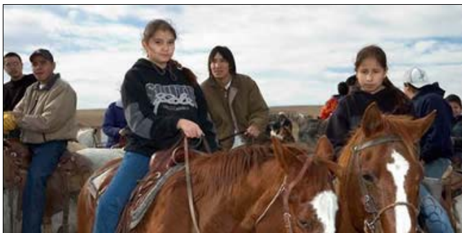
Pineridge children on horseback