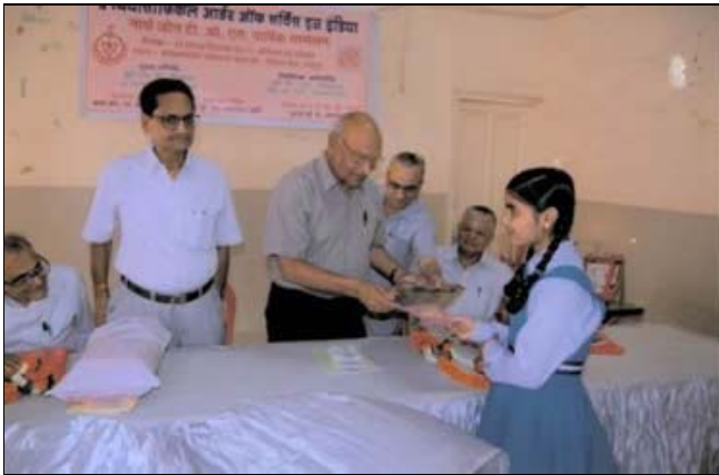
The awards were given to the poorest of the poor. Over half the population of the state of Chhattisgarh is Adivasi. The awards are to encourage education among such tribal people.