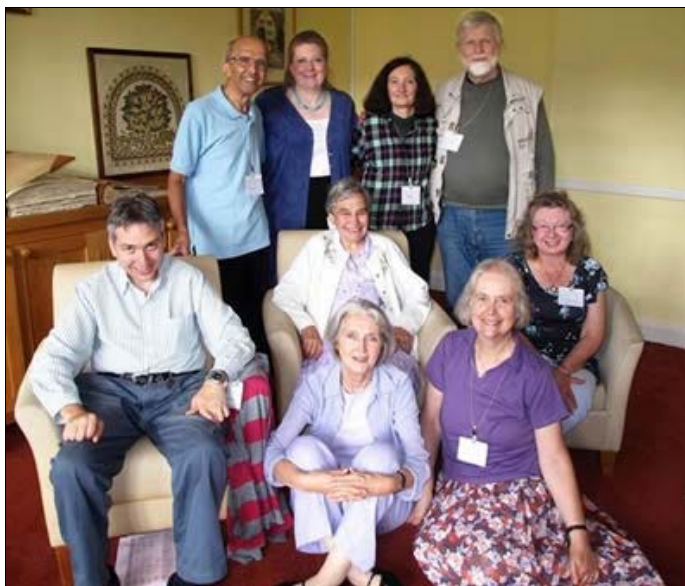
The Annual General Meeting of the English TOS takes place at the TS's Summer School each year. Decisions are taken and plans made with lots of humour yet efficiently.