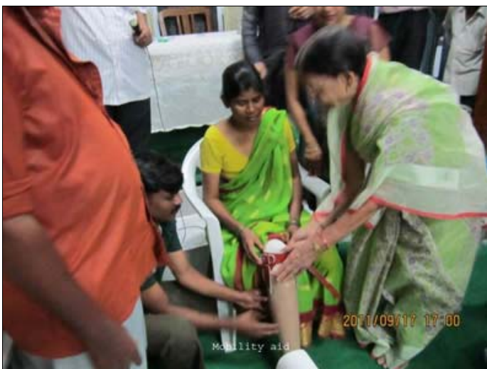
Five people received artificial limbs.