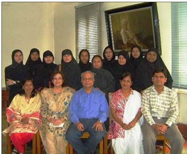
Our sisters and brothers of the TOS in Karachi need and deserve our interest, care and moral support.

Formed last year in Hungary , the youngest TOS group in the world has already acquired official registration as a non-profit service organisation. This was necessary not to put distance between itself and the TS but in order to engage in certain forms of service permitted only to registered organisations in that country. The group's first major undertaking has been to 'adopt' a flood-affected town in the north. While its first gesture has been to offer emergency relief, its long term goal is to help the villagers build their own active self-help community. An interesting facet of the TOS's work is the self-training its members engage in to develop the skills needed for service work. For every four or five newcomers, a special orientation programme is planned in which the whole group participates. The members wish to ensure that their service work is thoroughly grounded in what they refer to as 'theosophical spirituality'. A fresh report and photos will appear in our newsletter of Feb 2012.