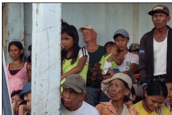
The residents and recipients of the construction materials