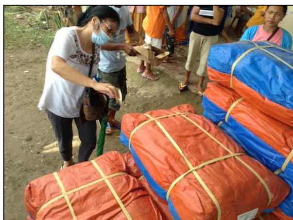
1,500 sleeping mats were donated by Borland Development Corporation.