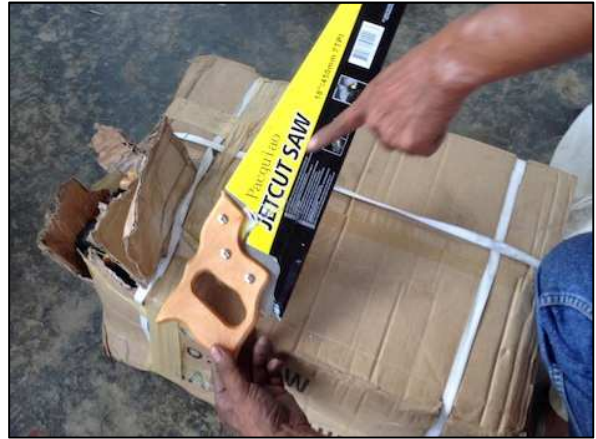
Above are some of the building materials and tools provided for those who will be rebuilding their houses.