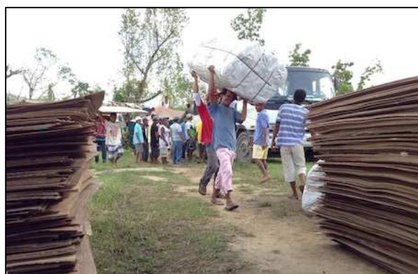
1, 950 sheets of Lawanit 4' x 8' plyboard were delivered to Sara town residents.