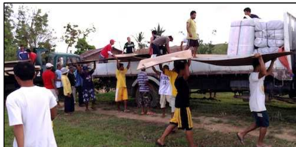
The goods are being unloaded by the residents of Sara, Iloilo.