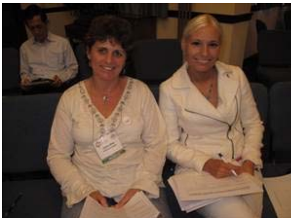
TOS workers from Hungary