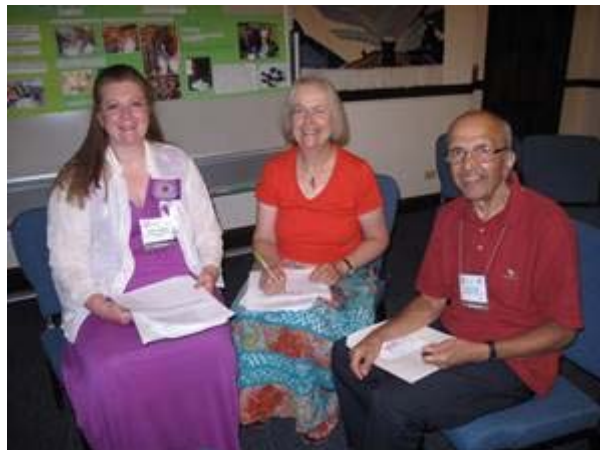
TOS workers from the UK