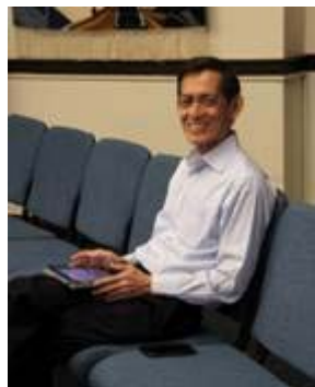
TOS worker from the Philippines