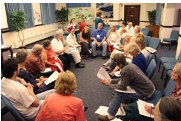
TOS workers from the USA