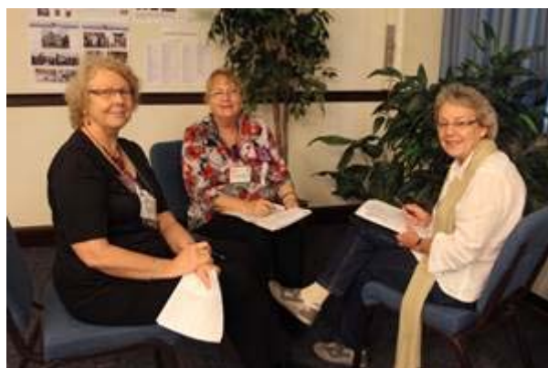
TOS workers from Australia