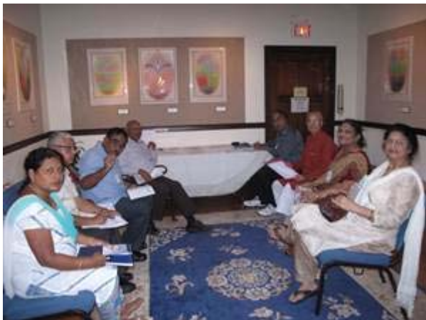
TOS workers from India