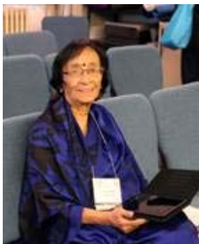
TOS worker from Kenya