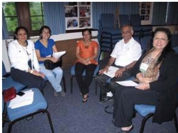
TOS workers from Tanzania